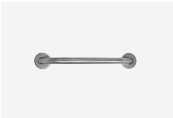
Straight Grab Bar - 450mm TSL.GR45.450