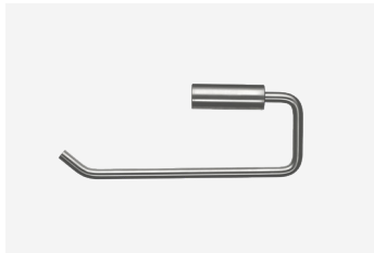
Double Toilet Roll Holder TSL.46

For warranty terms and conditions please visit www.thesplashlab.com If additional spare parts are required and are not listed above, please contact us at info.uk@thesplashlab.com