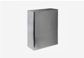
25L Waste Receptacle TSL.279