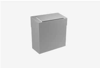
Wall Mounted Waste Bin TSL.909