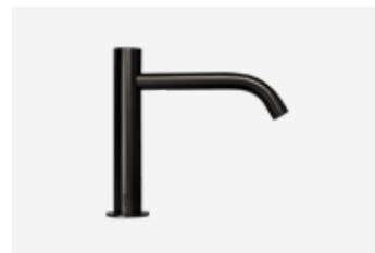
Sensor Deck Mounted Tap / Large TSL.960