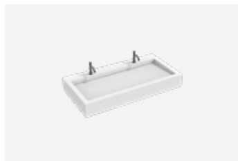
The Monolith L Series TSL.L