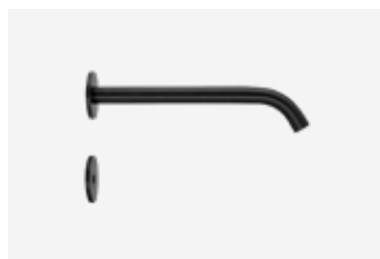
IR Sensor Tap TSL.882