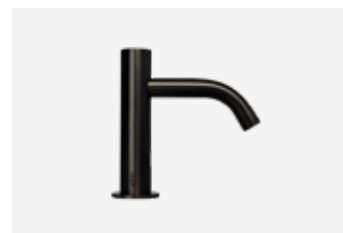
Sensor Deck Mounted Tap / Small TSL.990