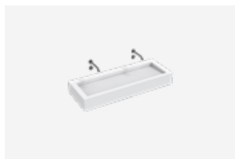
The Monolith M Series TSL.M