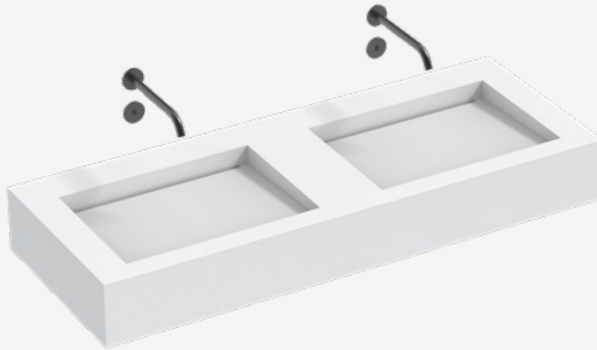
+ TWO USER BASIN

The Monolith M+ Series is a modular solid surface basin system. The divided trough and shallow rear deck is ideal for both wall-mounted and deck-mounted features. This Monolith is available in a range of standard and bespoke lengths to accommodate users in any washroom.