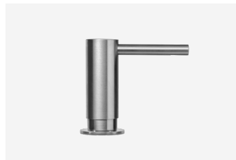
Deck Mounted Soap Dispenser TSL.410