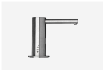
Sensor Deck Mounted Soap Dispenser TSL.420