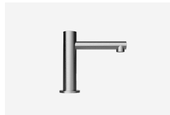
Straight Spout Tap / Small TSL.980