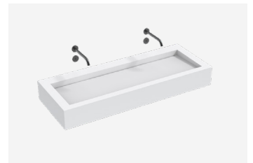
Monolith M Series - 450mm TSL.M