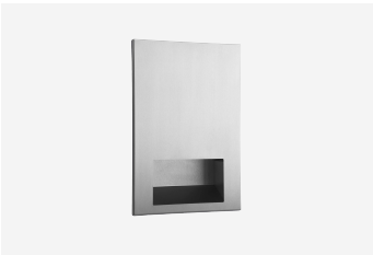
Combination Units - Paper Towel TSL.CM8

For warranty terms and conditions please visit www.thesplashlab.com If additional spare parts are required and are not listed above, please contact us at info.uk@thesplashlab.com