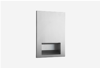
Combination Units - Hand Dryer TSL.CM9