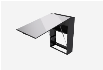
Behind The Mirror System / 600 TSL.MR30