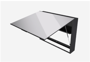
Behind The Mirror System / 1200 TSL.MR40